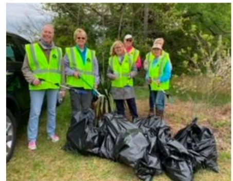
Coastal Gardeners Spring Clean-up near Delaware Botanic Garden.