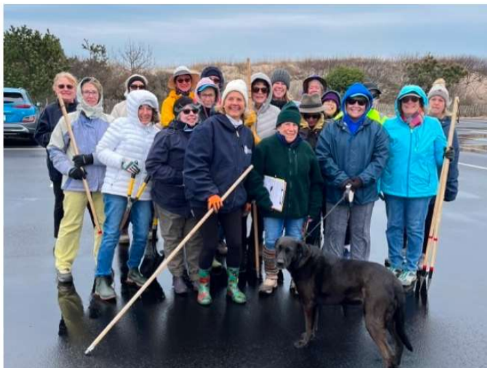
On March 18, 2023, a cold and windy Saturday, 21 members representing Coastal Gardeners assisted with planting Cape American Beach Grass at Tower Roads Beach, part of the Delaware State Park system.