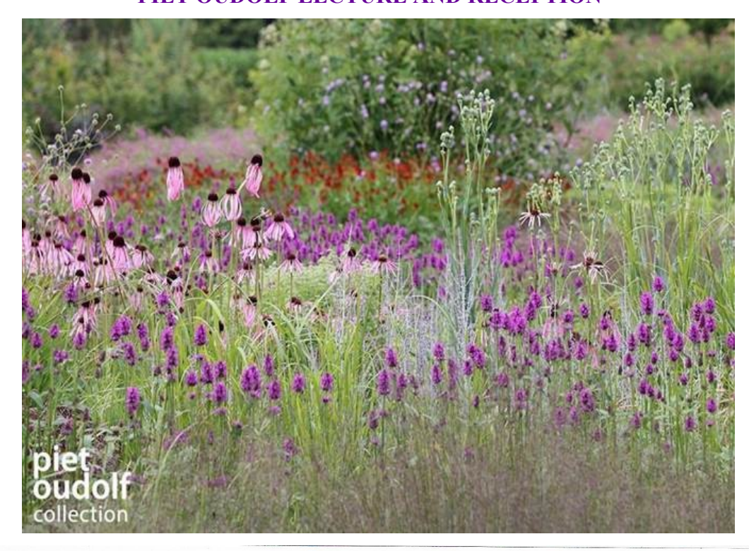
Friday, September 8,2017 Lecture 3:00-5:00PM Reception 6:00-8:00PM