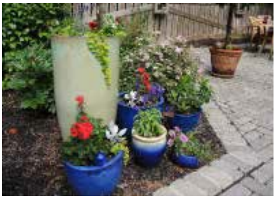
On June 3, the Seaford Spade & Trowel Garden Club presented "Through the Garden Gate," a tour of nine gardens throughout the Seaford area. The Club was very grateful to homeowners who graciously opened their gardens for visitors to enjoy and for sponsors listed in the tour guide/ticket. The Nanticoke Yacht Club served as a home base for the tour and featured many vendors, a plant sale and the opportunity to purchase a boxed lunch. Funds raised by the Club, a 501(c)(3) non-profit organization go toward community projects and scholarships.