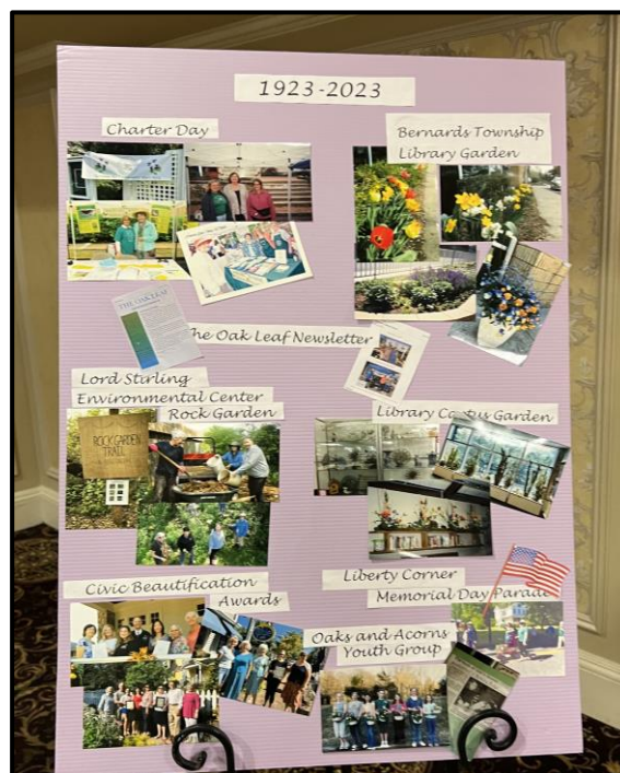
Display board highlighting 100 years of gardening

I am pleased to announce that two new garden clubs have joined our ranks and boosted our membership. The Upper Saddle River Garden Club has sixty-nine members and the Garden Club of Salem County has four members. Whether the club be large or small, we welcome them to GCNJ.