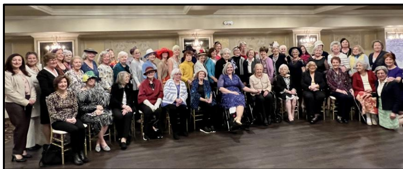
Members of the Basking Ridge GC

Two New Jersey garden clubs received $1000 NGC Plant America Grants. Congratulations to the Point Pleasant Garden Club and the West Trenton Garden Club for recognition of their Plant America projects.