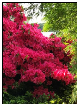
Azalea

The 2023-2025 Administration will assume office at the close of the National Garden Clubs Convention at the Greenbrier on May 4, 2023. Please join me in welcoming our new leadership.