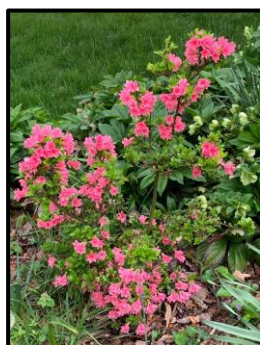
Azalea