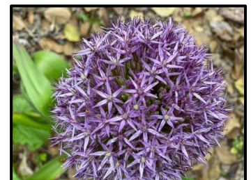
Allium Itoh Peony