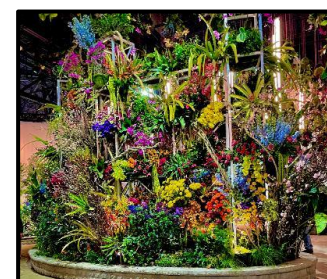
At the Philadelphia Flower Show